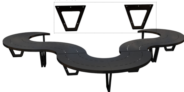
outer bracket element 3