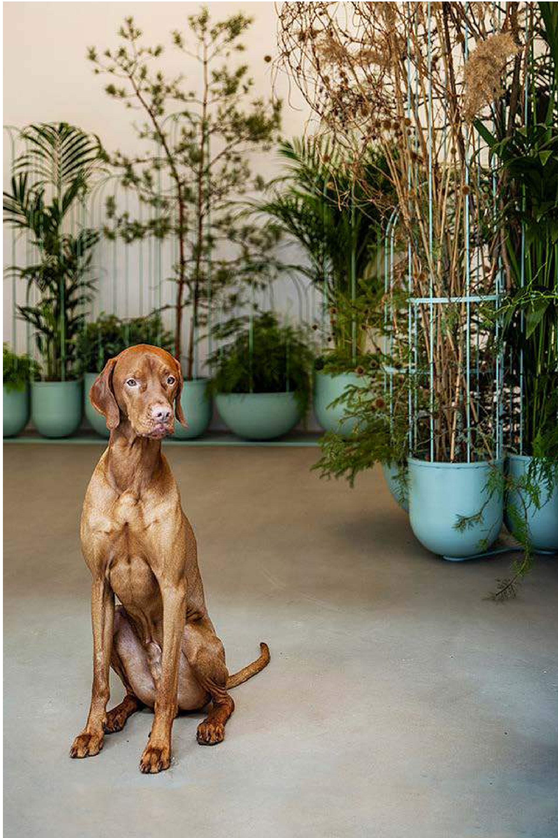
Previous page and this page: Cacti planter is for indoor use, and makes a nice additiuon to any office or lobby where you want to use plants as room dividers.