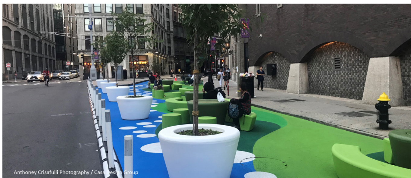
Anthony Crisafulli Photography / Casa Design Group