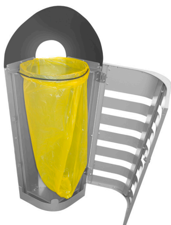
Sidney frontal door