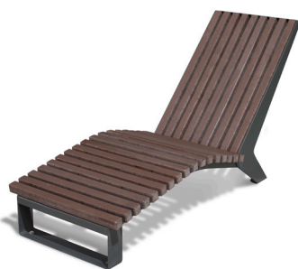
RecyPlast (recycled plastic)