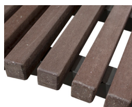
RecyPlast (recycled plastic)