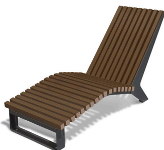
WPC (wood composite)