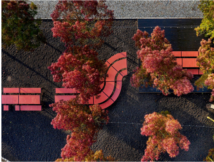
Långbordet picnic table 100 cm section + frames with and without armrests

Nola > Products > Långbordet picnic table