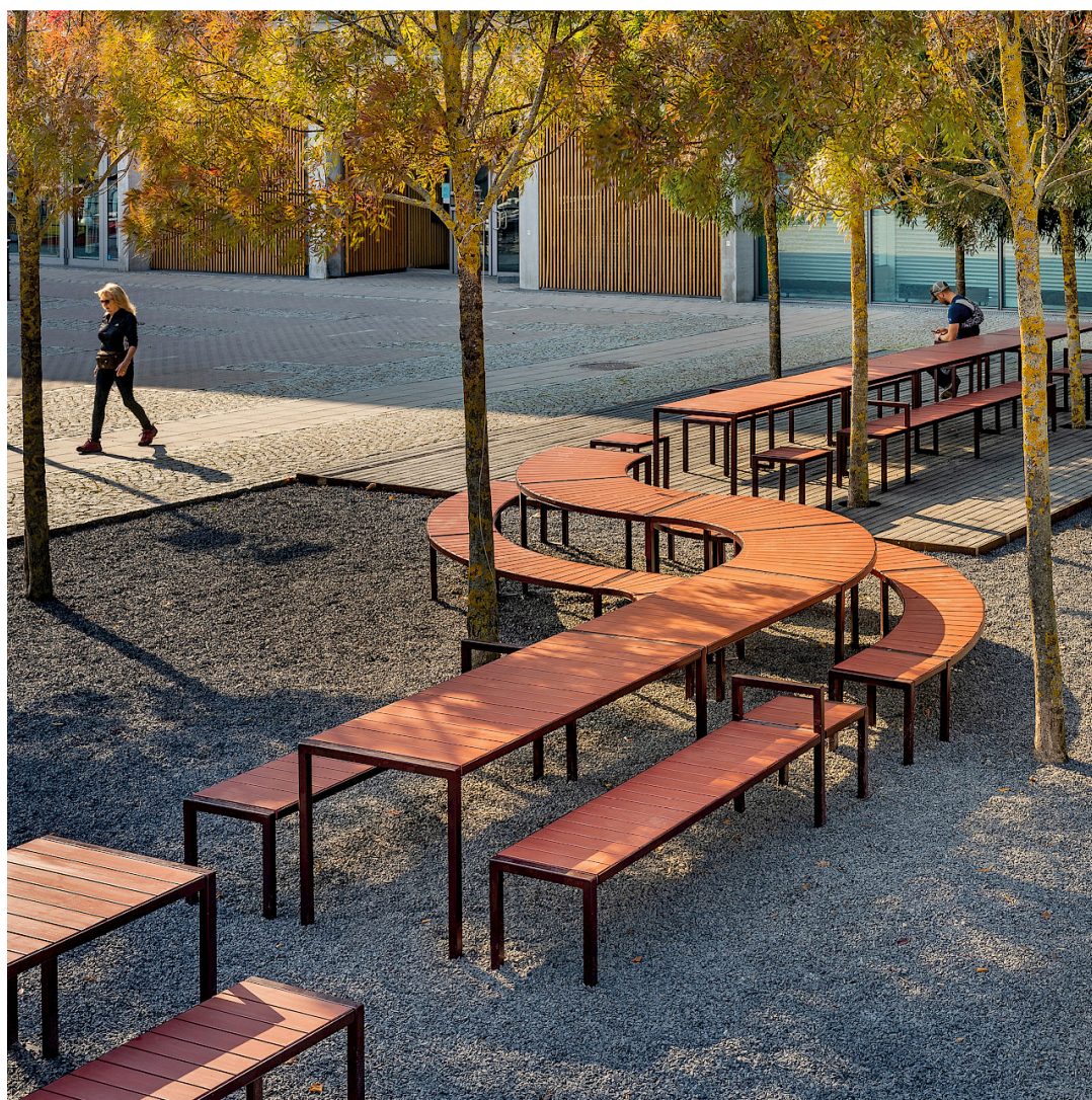
Hamntorget, Södermalm, Stockholm.

A dynamic, modular bench table system that can be extended lengthways or create circular shapes and curves. The system is wheelchair accessible.