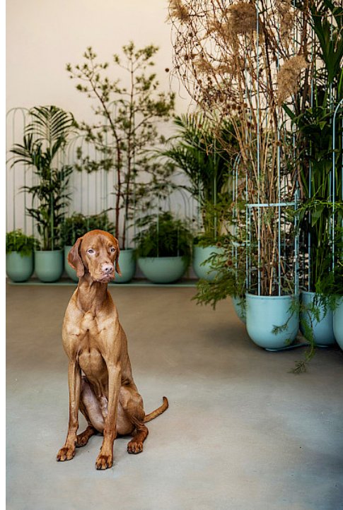
Cacti planters displayed during Stockholm Design Week with plants arranged by Claes Carlsson.